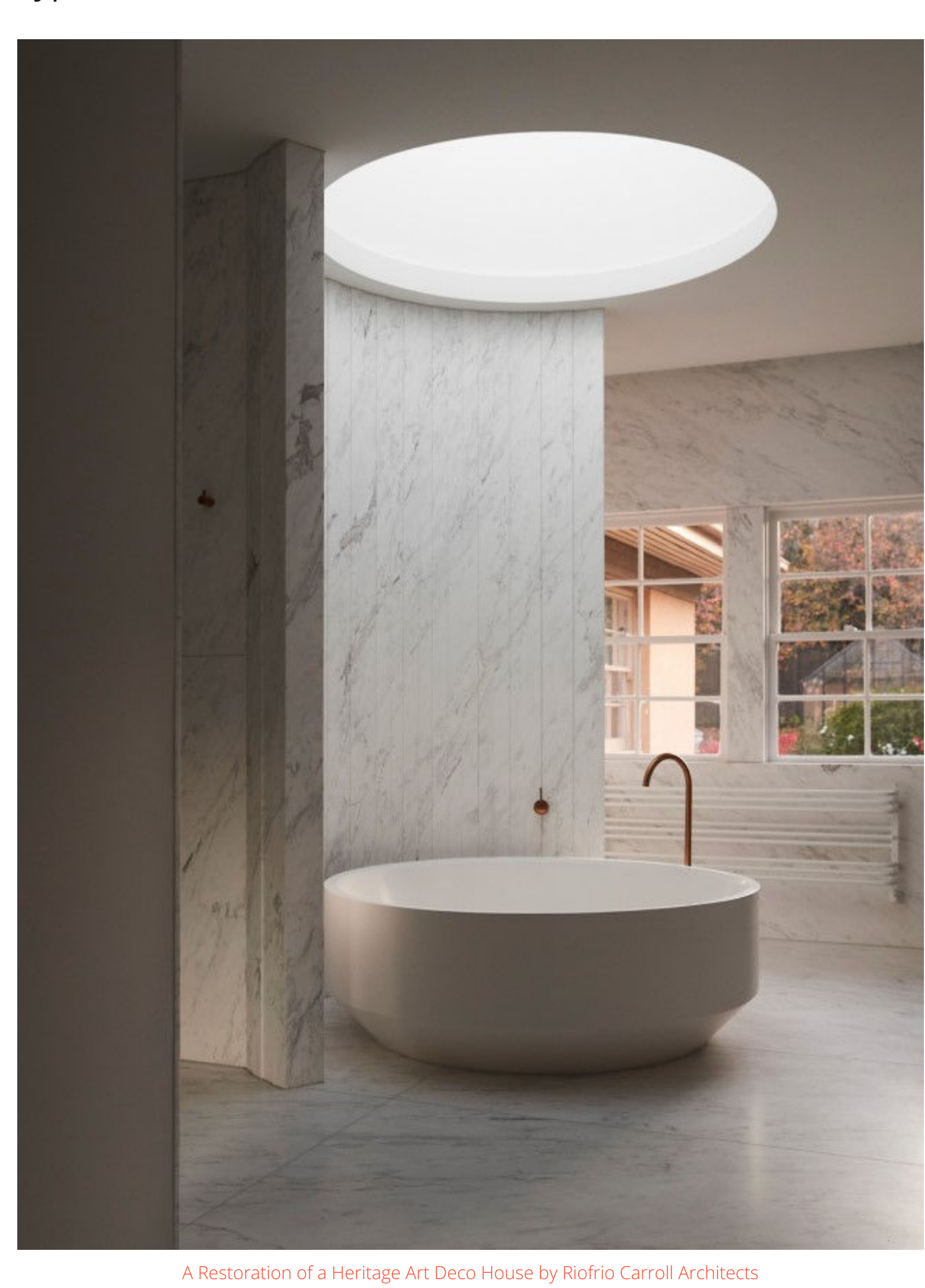
Shopping for bathtubs can take a lot of work due to the sheer number of options available.