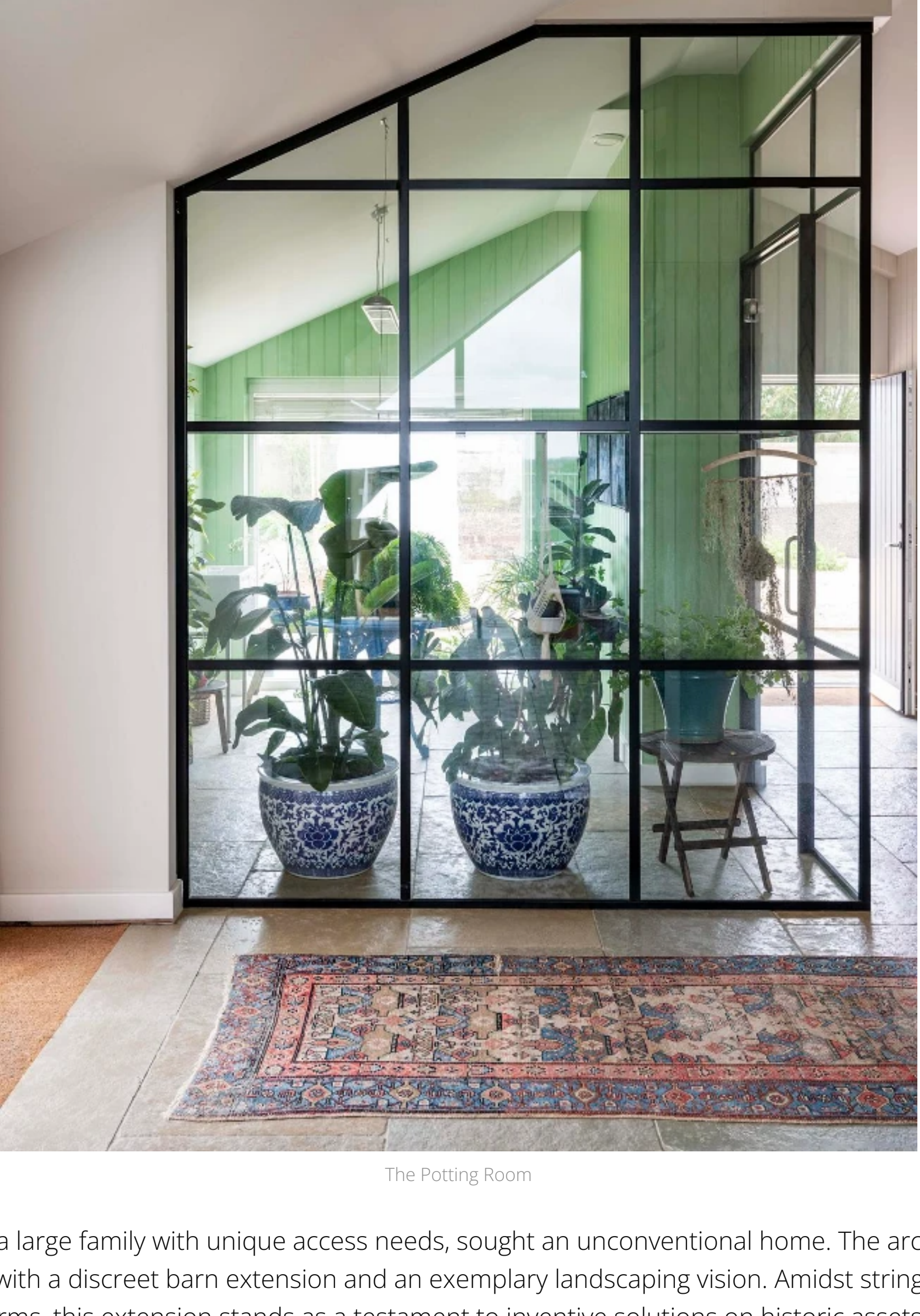
The Potting Room

The clients, a large family with unique access needs, sought an unconventional home. The architects responded with a discreet barn extension and an exemplary landscaping vision. Amidst stringent UK planning norms, this extension stands as a testament to inventive solutions on historic assets, destined to gracefully meld with evolving landscapes. The primary structure boasts insulated woodcrete ICF and a timber roof, setting a green precedent.