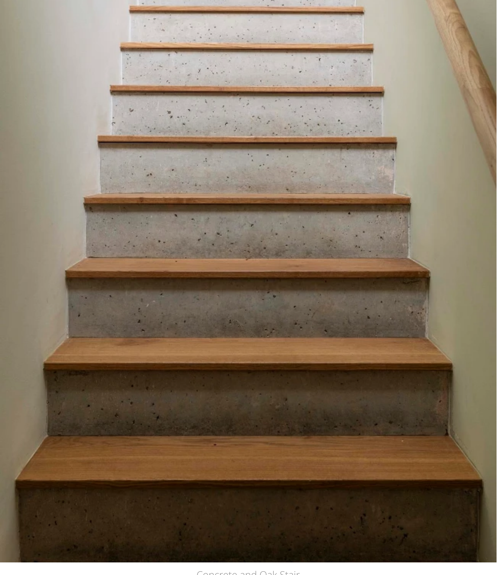
Concrete and Oak Stair