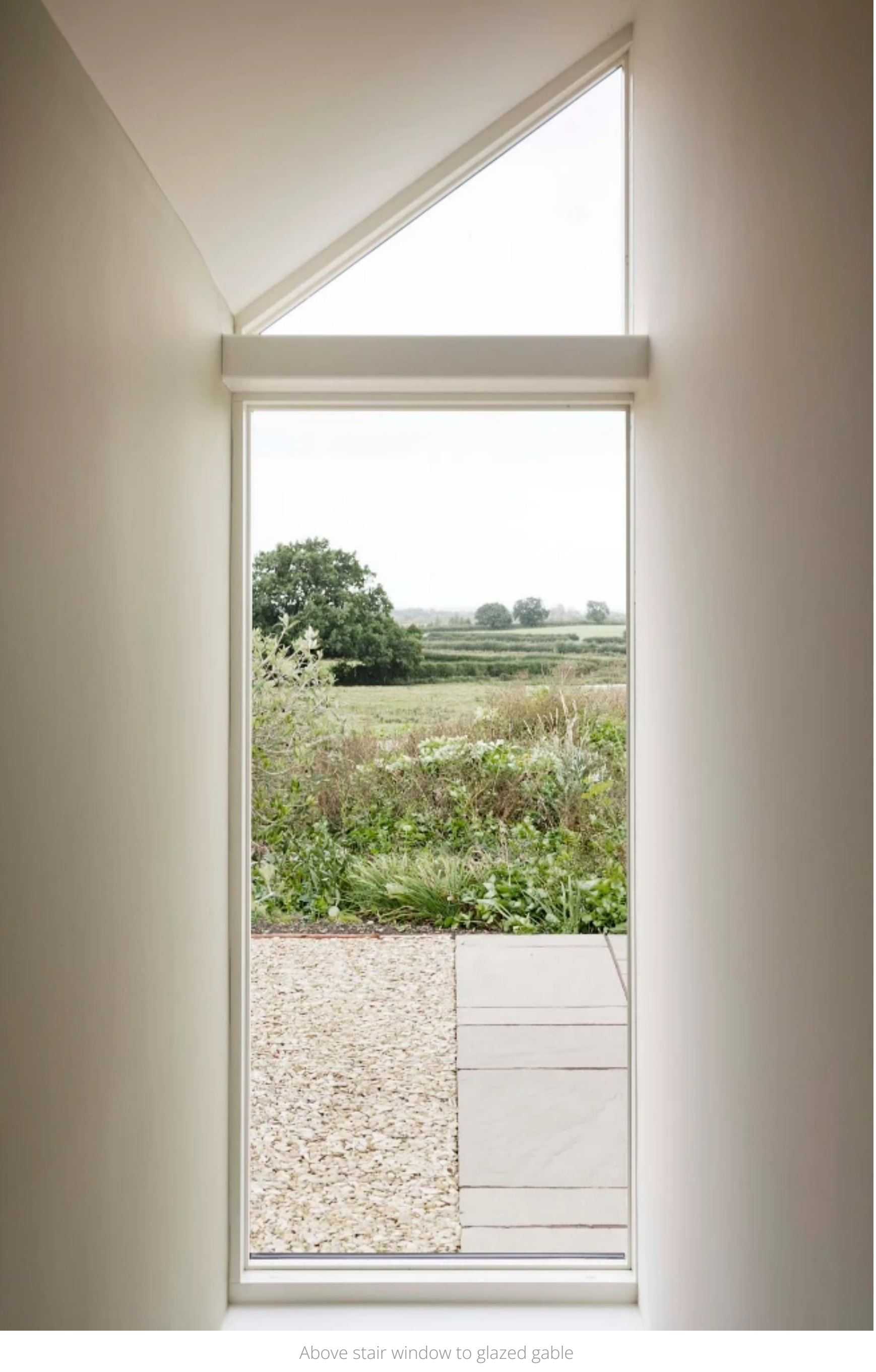
Above stair window to glazed gable