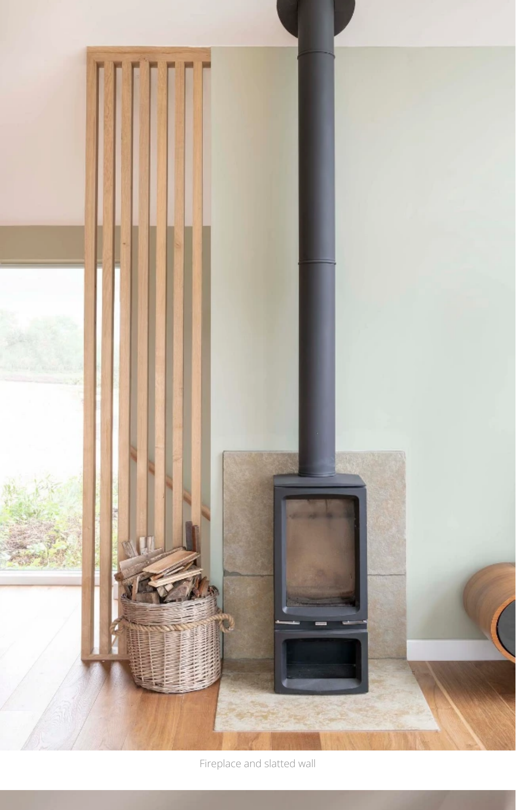
Fireplace and slatted wall